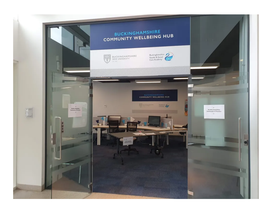
The entrance to the Community Wellbeing Hub (as seen from inside the BNU Aylesbury campus main reception atrium)